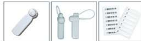
AM Hard Tag 1 AM Hard Tag 14 AM Soft Label 1