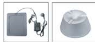
AM Deactivator AM Detacher